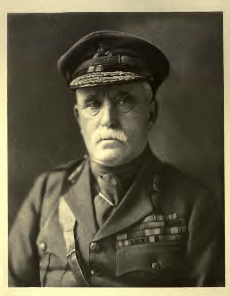
20 Jum n. Book by: The with you house 1818